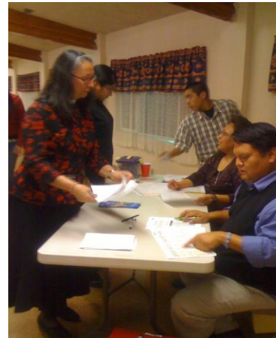
American Indian Community Council Elections, 2005