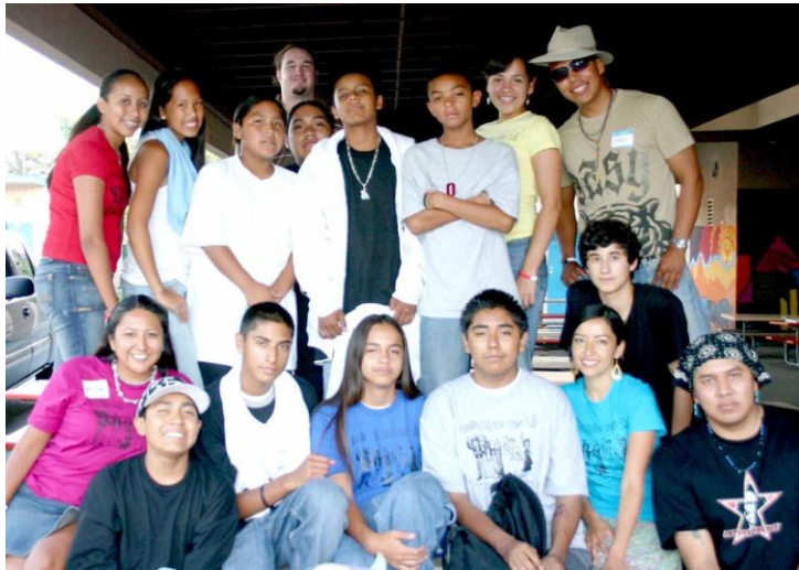
United Native Youth Los Angeles, 2004

American Indian Children's Council, 1996