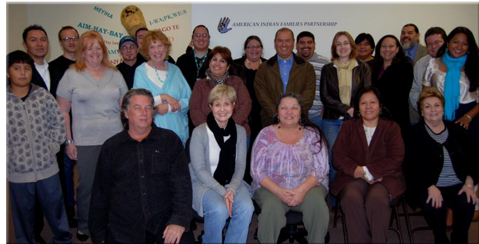
American Indian Family Partnership,